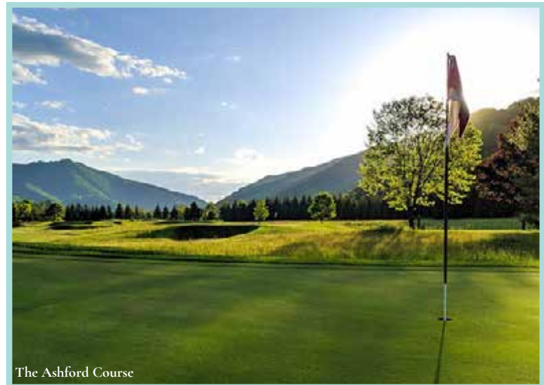
The Ashford Course