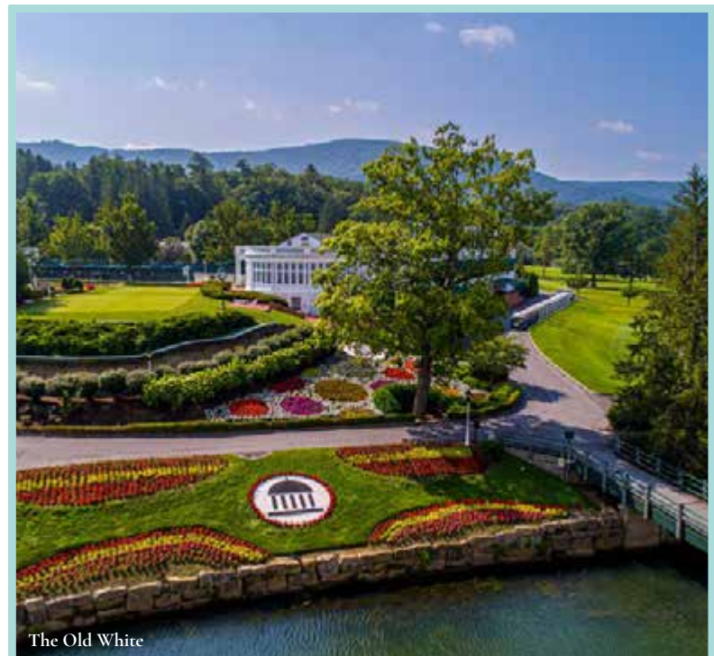
The Old White

Many guests aren't aware of the Ashford Short Course at The Greenbrier Sporting Club. The Greenbrier Golf Club offers a shuttle to the 9-hole, par-3 walking course twice a day — once at 9:00am and once at 2:00pm, and golfers have one hour to play as many holes as possible. It's a perfect place to settle a friendly wager, work on your short game or for a young golfer to learn the sport and experience success.